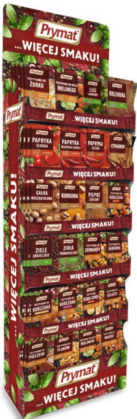
Prymat „Beczka” cardboard

width : 51 cm depth : 27 cm height : 178 cm