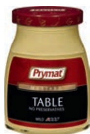
Table mustard mild

net weight : 185 g no. of items in a collective packaging : 9 pcs. no. of items on a pallet : 2 376 pcs. shelf life : 12 months language version : pl/en